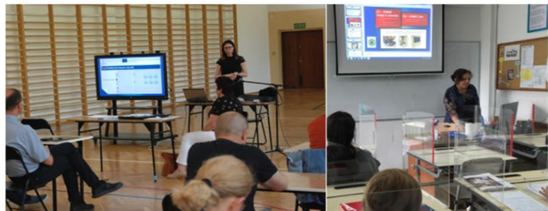
Figure 1 Validation activities in Poland